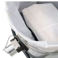
Safe bag for toxic material