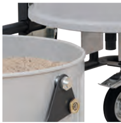
Solid cut-off system (SC)