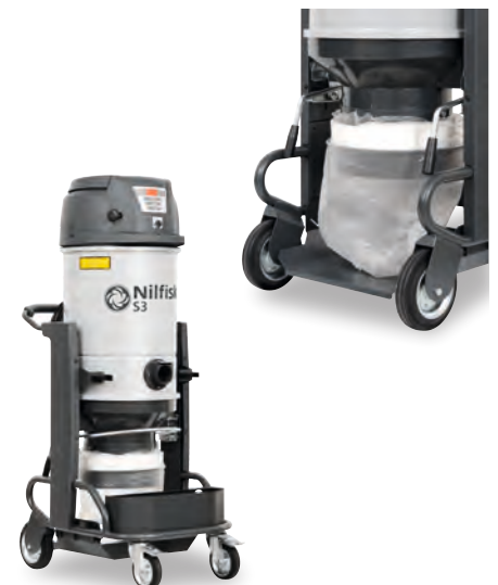
S3 with gravity unload system with Longopac®.