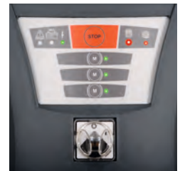
Electronic board control