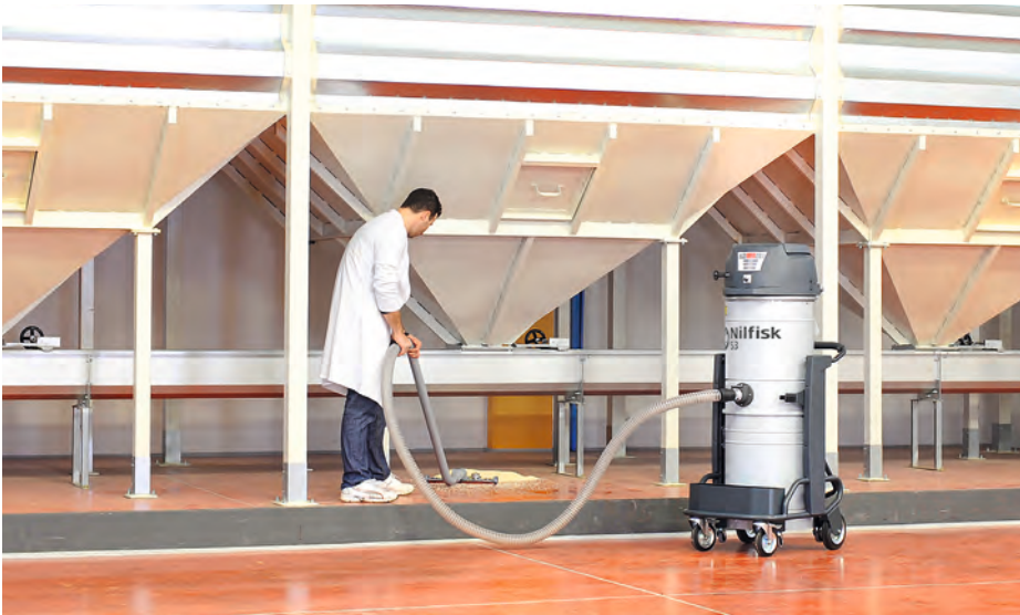
Cleaning of production lines.

Lifting system: an useful kit, consisting of support, belt and handles, allows to move the vacuum by a forklift or a bridge crane.