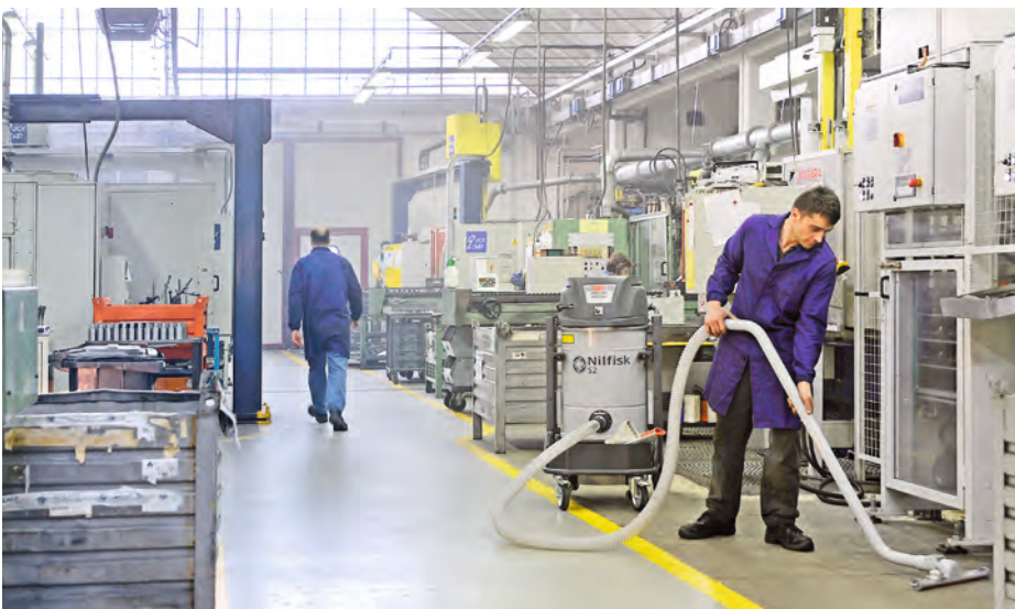
Cleaning of a metal company.