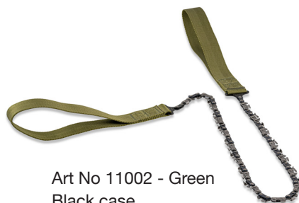
Art No 11002 - Green Black case