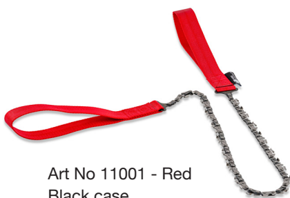
Art No 11001 - Red Black case