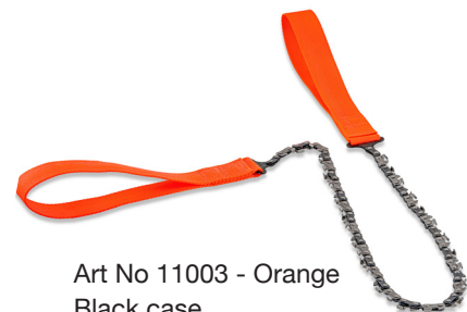
Art No 11003 - Orange Black case