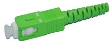
SC/APC SM SX