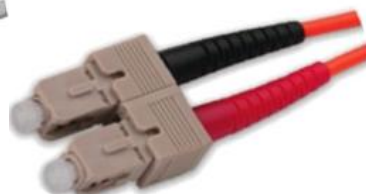
SC/PC MM DX