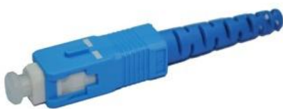
SC/PC SM SX