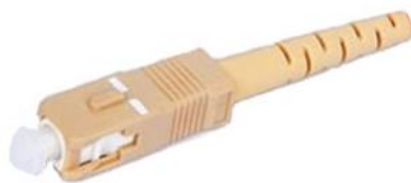
SC/PC MM SX