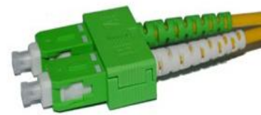
SC/APC SM DX