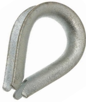
Galv. Kovs, Form B, DIN 6899 Galv. Thimble, Form B, DIN 6899