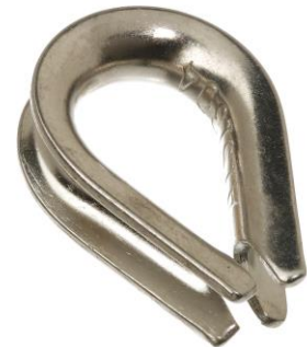
Rustfri, AISI 304 Kovs, DIN 6899, Form B S.S. Thimble, AISI 304, DIN 6899, Form B