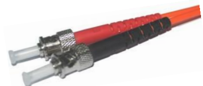
ST/PC MM DX