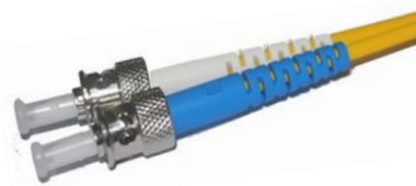
ST/PC SM DX